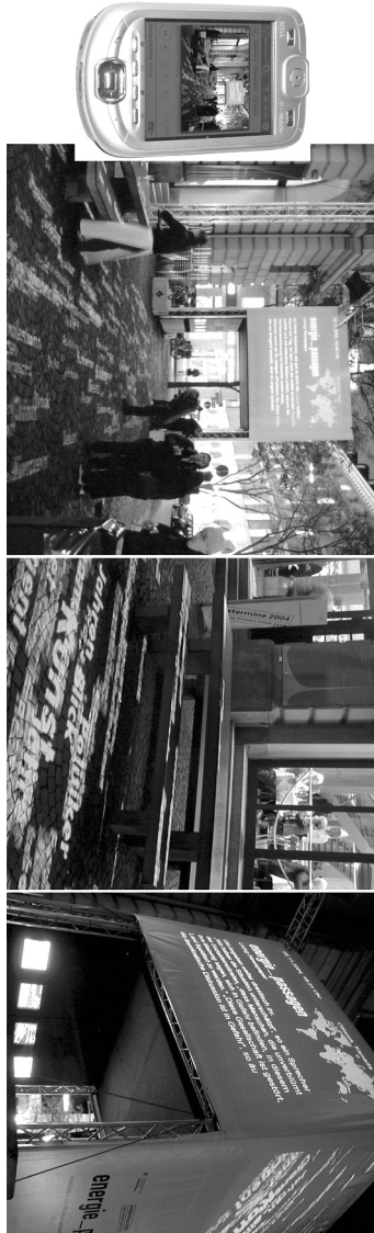
Fig. 3. Energie-Passagen – interactive installation in public space (2004)

mation” in November 2004 in front of the “Literaturhaus” in Munich. Visitors could choose definitions on-site and “interpose” them into the flow. In this way text movements are set into motion, which allow connections between the definitions to emerge. The definition network creates new meanings, which differentiate themselves from the original linear texts. Computer voices react directly to the intervention of the visitor and accompany him or her as multi-voiced echo. In addition, a world map visualises the journey, which then takes the chosen definition through the geographic landscape of the news. The visible result of the visitors’ preferred words is the “Living Newspaper”. Its dynamically generated choice is projected within their original sentence onto the “information cube”. The deconstruction of the newspaper, which results from the fragmentation of its original contents, leads to an unaccustomed reading and understanding. The artificial voices of the flow invite the discovery of new sense correlations. The spectators find themselves in an aura of speech and luminous symbols. It creates an atmosphere of liveness between audience and place that allows immersion (consumption) as well as reflexion (evaluation).