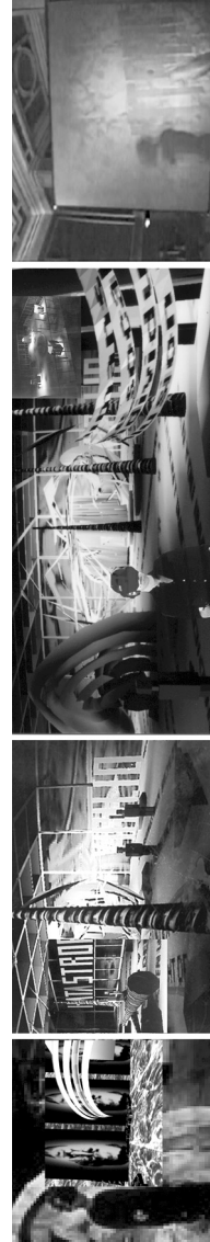
Fig. 1. Home of the Brain – VR Installation (1991)

Virtual Reality evolved from mechanical simulators for the training of combat pilots in the Second World War and computer graphics research in the early 60s. “Virtual Art” 9 , based on Virtual Reality (VR), the making of interactive environments, had nearly no resources in the traditional art world to have recourse to. In “The Ultimate Display”, computer scientist Ivan Sutherland (1965) published the theoretical foundations for VR: “The ultimate display would, of course, be a room within which the computer can control the existence of matter. A chair